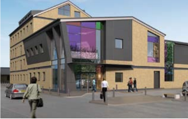
Artists impression of the new YMCA building