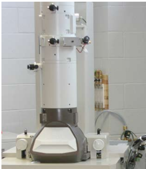
Analytical Equipment University of Derby

This project has been awarded £239,507 by DDEP