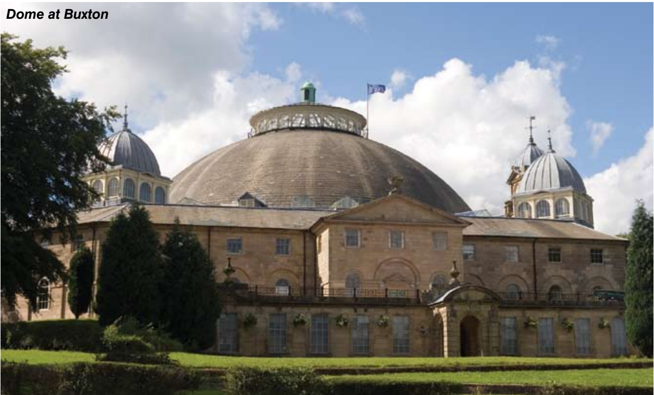
Dome at Buxton