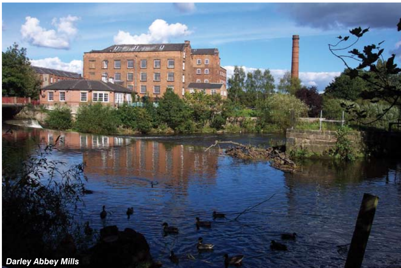
Darley Abbey Mills

This project has been awarded £85,000 by DDEP.