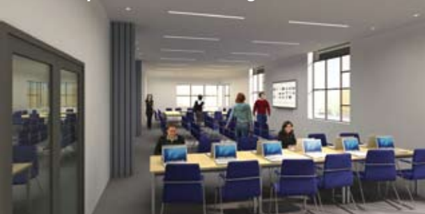
Artists impression of training room at YMCA

The project has been awarded £312,416 by DDEP, which matches £312,421 from other sources.