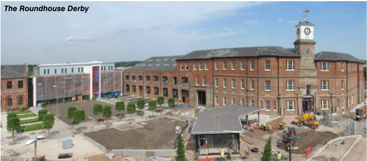
The Roundhouse Derby

The project, the total value of which is in excess of £38M, has been awarded £1.5M by DDEP.