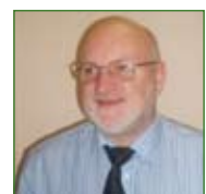
Pete Edwards Community & Voluntary Sector Hub