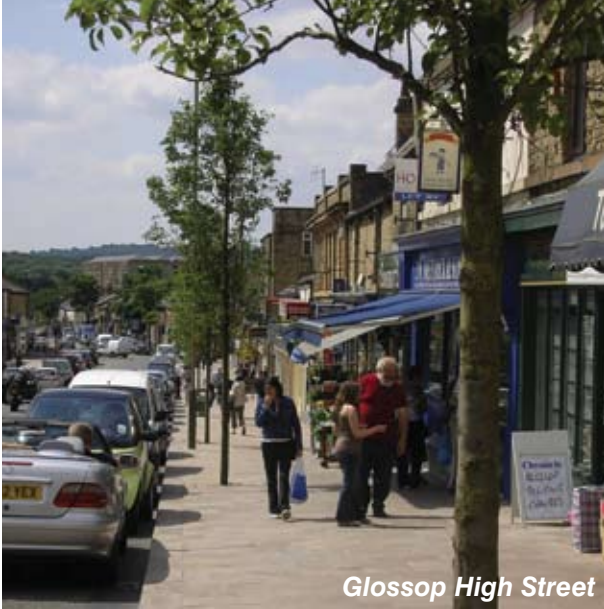
Glossop High Street