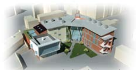
Artists Impression of Business and Enterprise Centre

The project has been awarded £2.7M by DDEP and £5.4M from other sources.