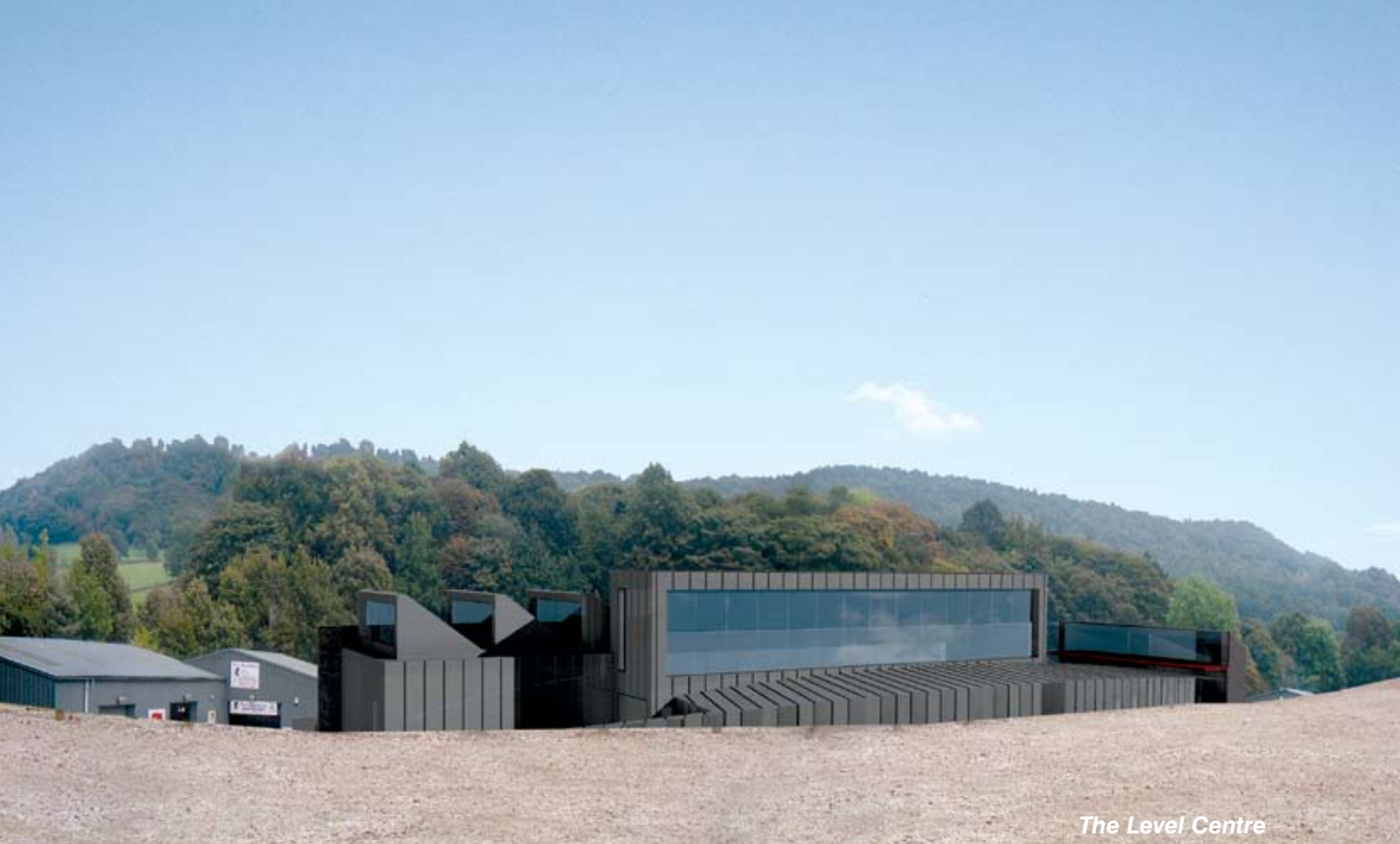
The Level Centre